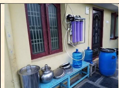
Water Filtration System