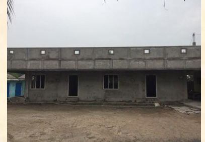
New Dining Hall (Under Construction)