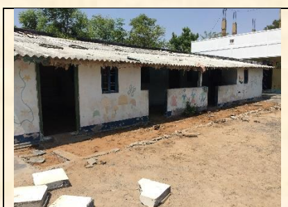
Old Dining Hall